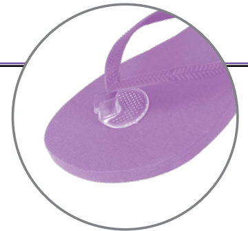
Protects & Relieves