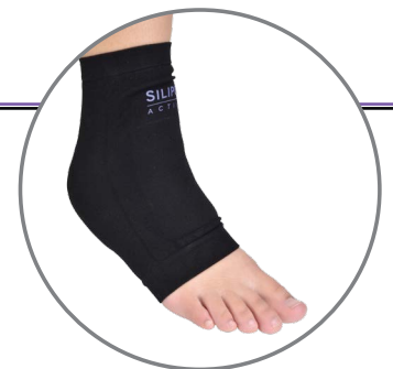
Comfort, Cushion & Protect