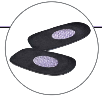
Absorbs Shock & Impact