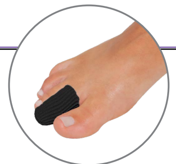
Relieves Pressure & Friction