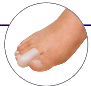
Relieves Pressure & Friction