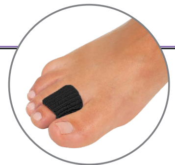
Relieves Pressure & Friction