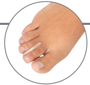
Divides & Cushions Toes