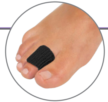
Relieves Pressure & Friction