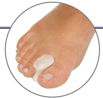
Separates & Cushions Toes