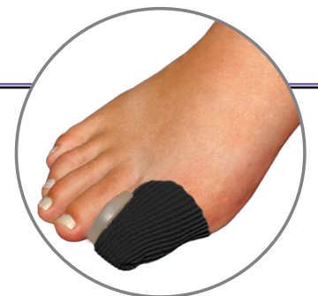
Relieves Pressure & Friction