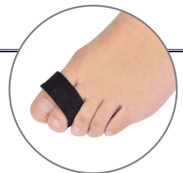
Relieves, Holds & Secures Toes