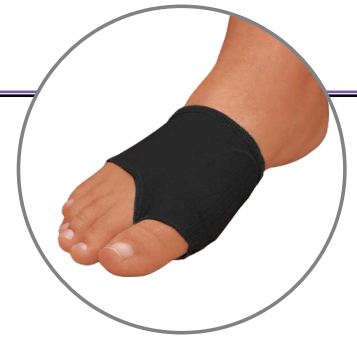
Helps Reduce Bunion Pain