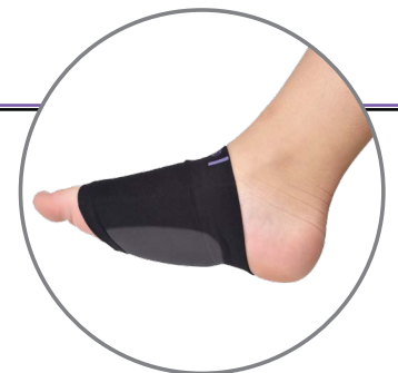
Reduces Heel & Foot Pain