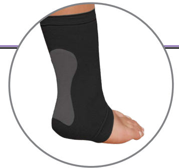
Relieves Pressure & Friction