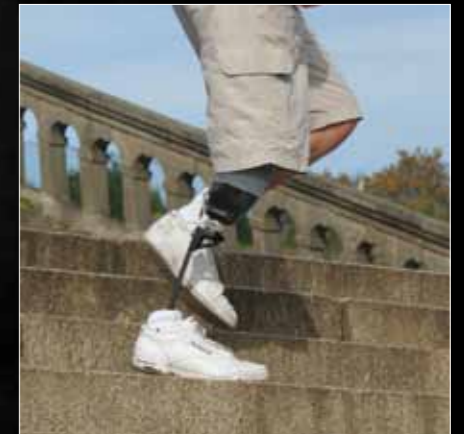
The active pylon flexes in a fluid and integrated kinematic response