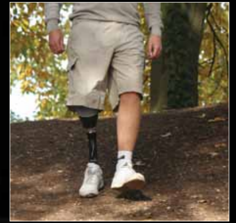
The e-carbon heel gives supple control and excellent compliance