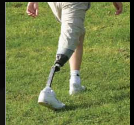
Javelin's lively toe enhances the naturalness of individual gait