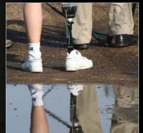
Slim good looks are not only the foot style but the cosmetic finish