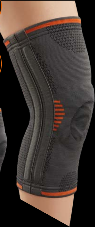
Elastic knee support long / 28 cm