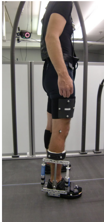
Figure 1. Experimental setup using the custom experimental AFO, Bertec split-belt fully instrumented treadmill and Vicon 3-D motion analysis system.